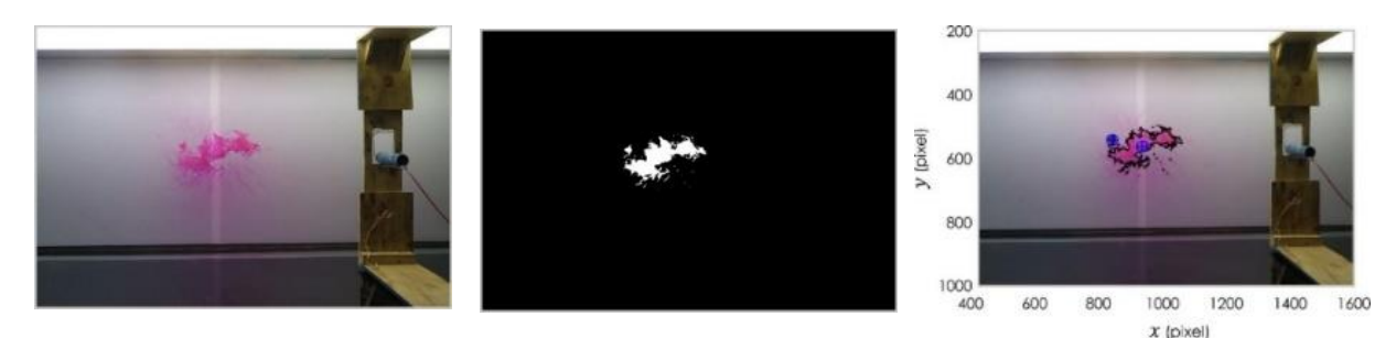
Fig. 1. Identifying the spill by imaging methods. From left to right: raw image, binary image, isolated spill.

the background is low. In the present case, the threshold was adapted to consider dilution and light changes along the flume. With the spill isolated, it is then possible to compute its geometrical characteristics, namely its perimeter and its area. With some assumptions regarding its thickness, it becomes also possible to calculate its volume. By applying this procedure to the whole footage, it is possible to estimate the evolution and fate of the spill.