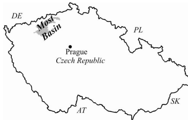
Fig. 1. Location of the Most Basin.