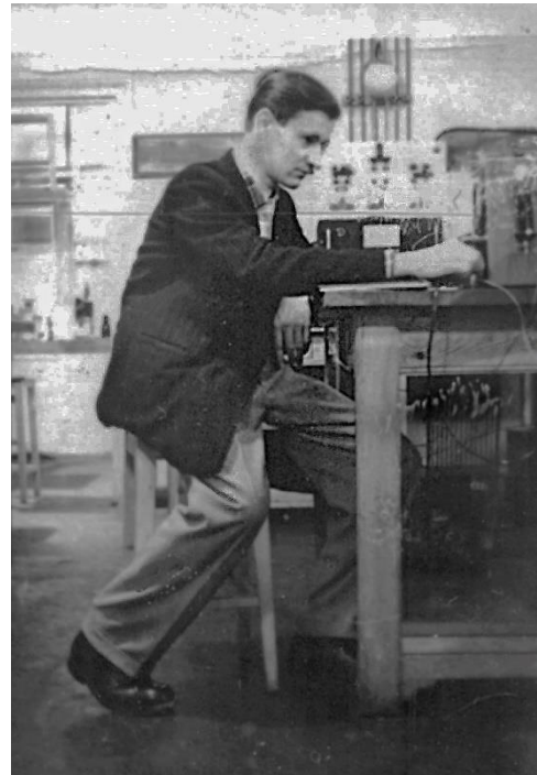
Fig. 1. Young student in the woods and in a laboratory.