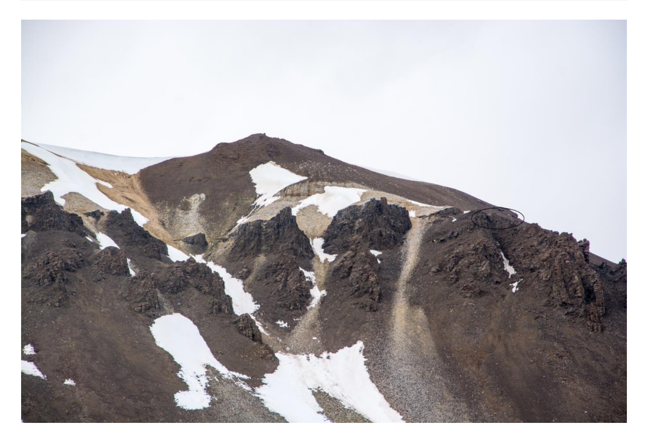
Fig. 2. Sill of the High Arctic Large Igneous Province intruding Permian evaporites of the Gipshuken Formation, in James I Land of Spitzbergen, Svalbard Islands. The sill in this outcrop is 10+ m thick. The black circle indicates the location of the samples with high-Cl biotite. Photo: Hans Jørgen Kjøll, summer 2021.