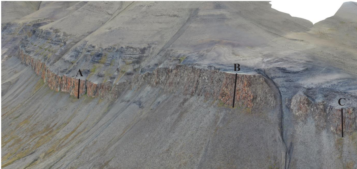
Fig. 2. An example of a digital outcrop model from Botneheia, central Spitsbergen (Rodes et al. 2024; Betlem et al. 2023). This intrusion, belonging to the Diabasodden Suite, was emplaced into Triassic shales. The thickness of this particular sill is at A: 33 m, B: 38 m, and C: 23 m.